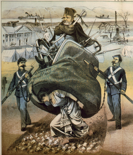
THE "STRONG" GOVERNMENT 1869-1877.