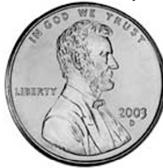
A bust of Abraham Lincoln is on the front of the penny.

The penny is one of several U.S. coins. Different coins have different cent values. The value of a penny is one cent and can be written as 1¢. If you have 100 cents, you have one dollar (100¢ = $1)!