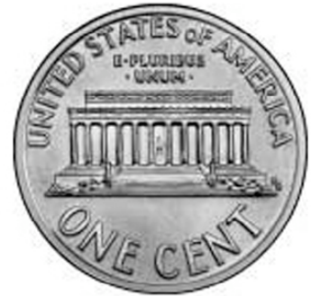
From 1959 to 2008 the Lincoln Memorial was on the back of the penny.